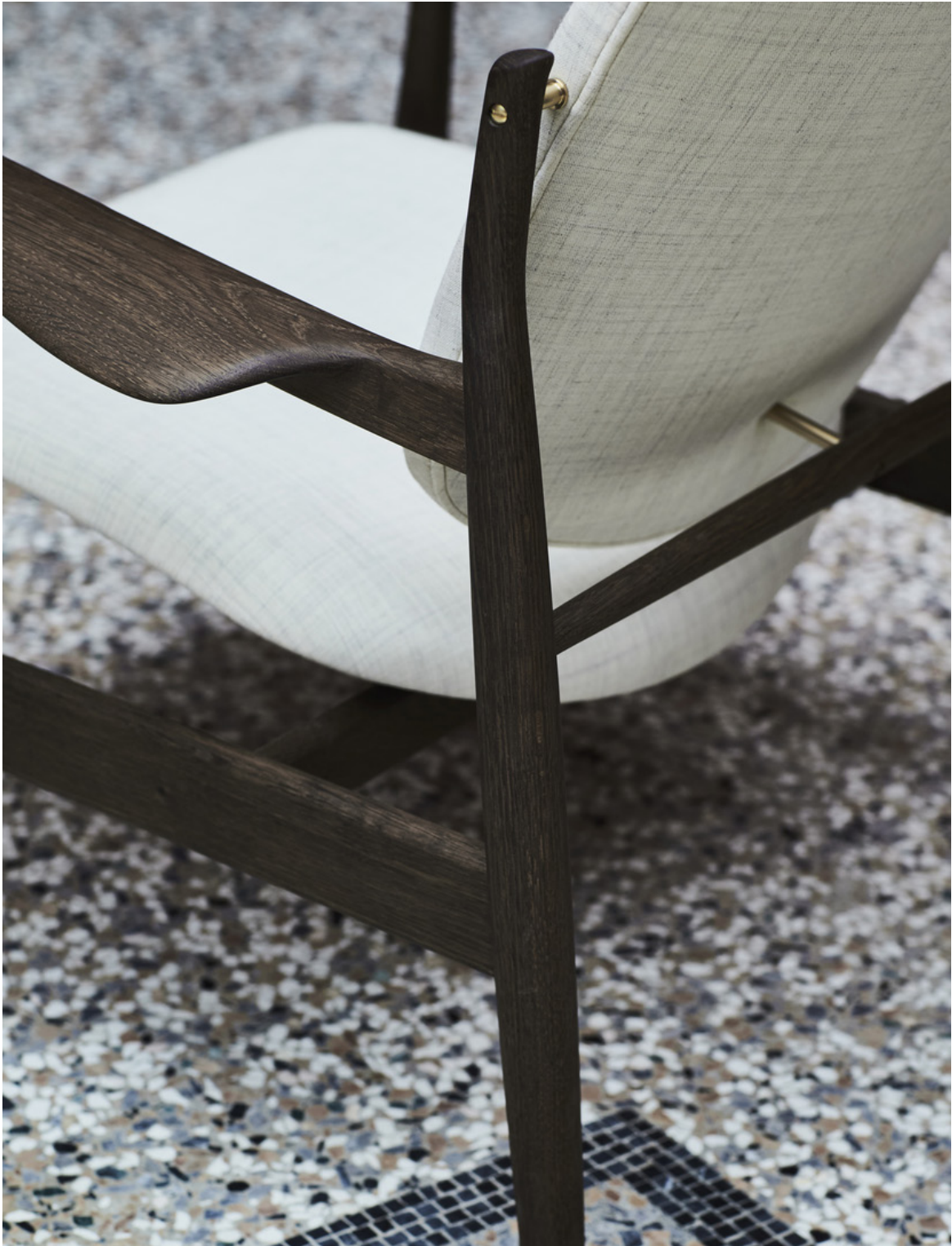
FRANCE CHAIR 1956 BY FINN JUHL